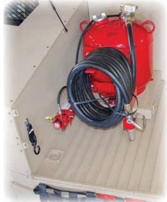
Shown with Vehicle Access Tray